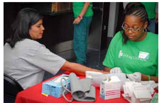
(TOP) Immunization (RIGHT) Vision Screenings and Dental Screening/Fluoride Treatment