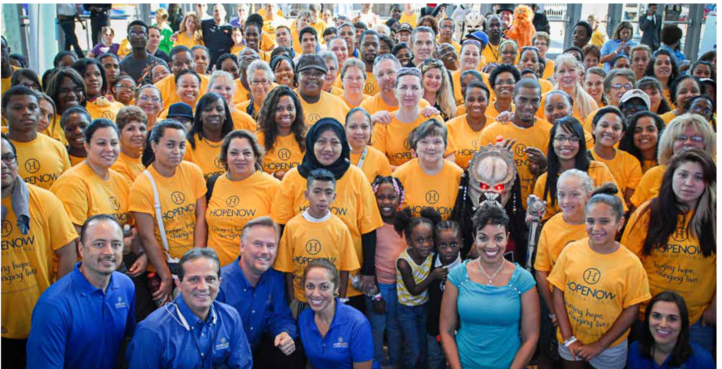
Volunteers from Central Florida come together to lend a hand and ensure a great experience for all at the 2014 Back To School Expo.