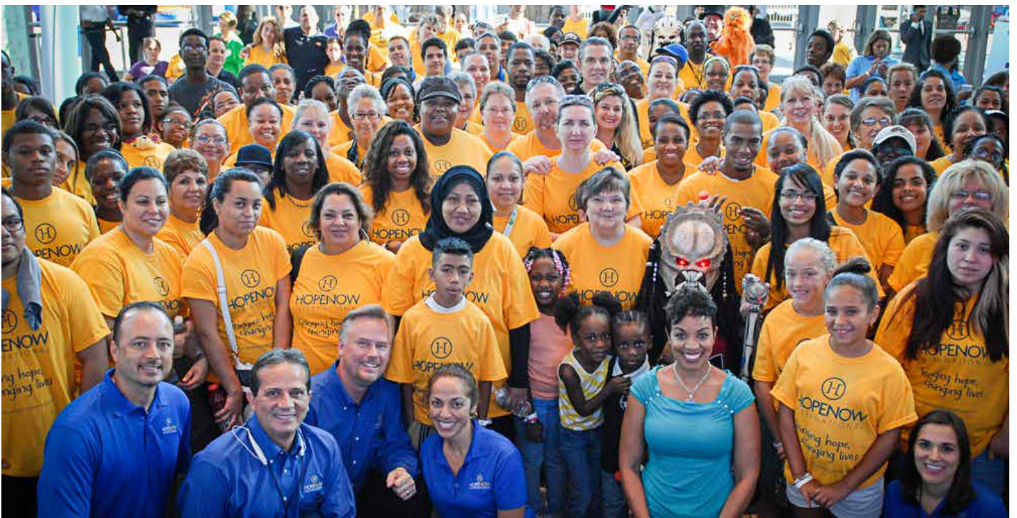
Volunteers from Central Florida come together to lend a hand and ensure a great experience for all at the 2014 Back To School Expo.