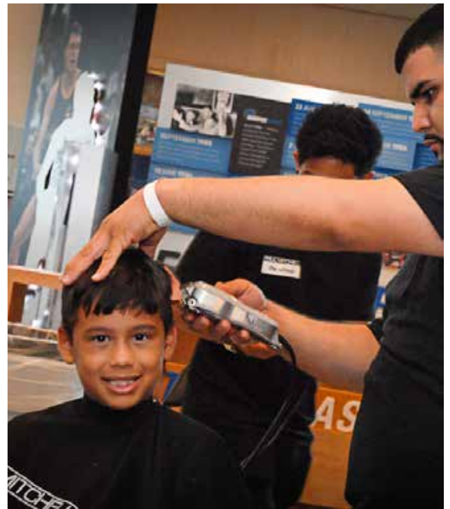
(TOP) Citrus Bowl Field Area (RIGHT) Haircut Area